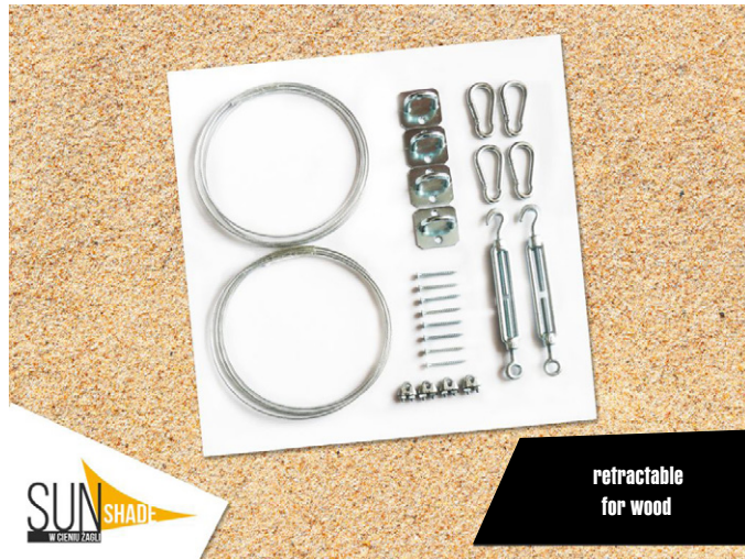
retractable for wood