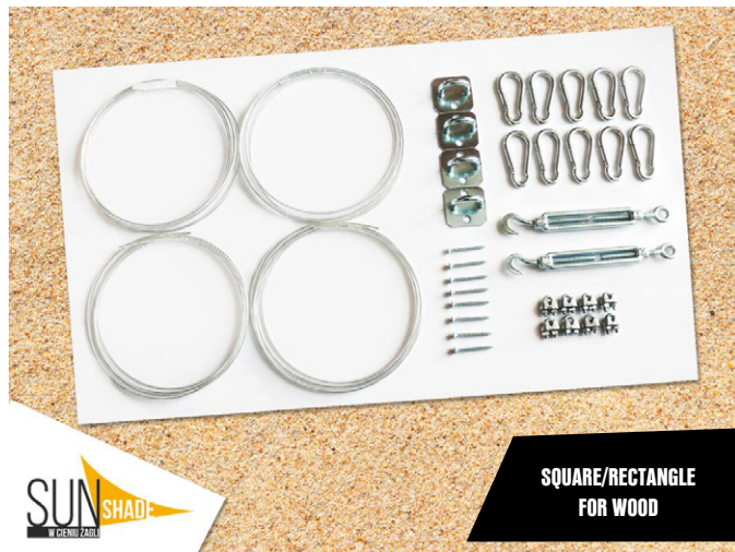
SQUARE/RECTANGLE FOR WOOD