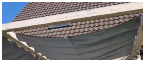
Figure 1b. Retractable sun sail on 2 ropes