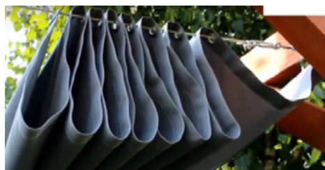
Figure 1a. Top of retractable sun sail on 3 ropes