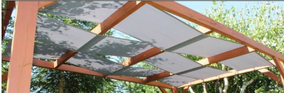
Figure 1. Gazebo/Roman strips of Premium Decor fabric